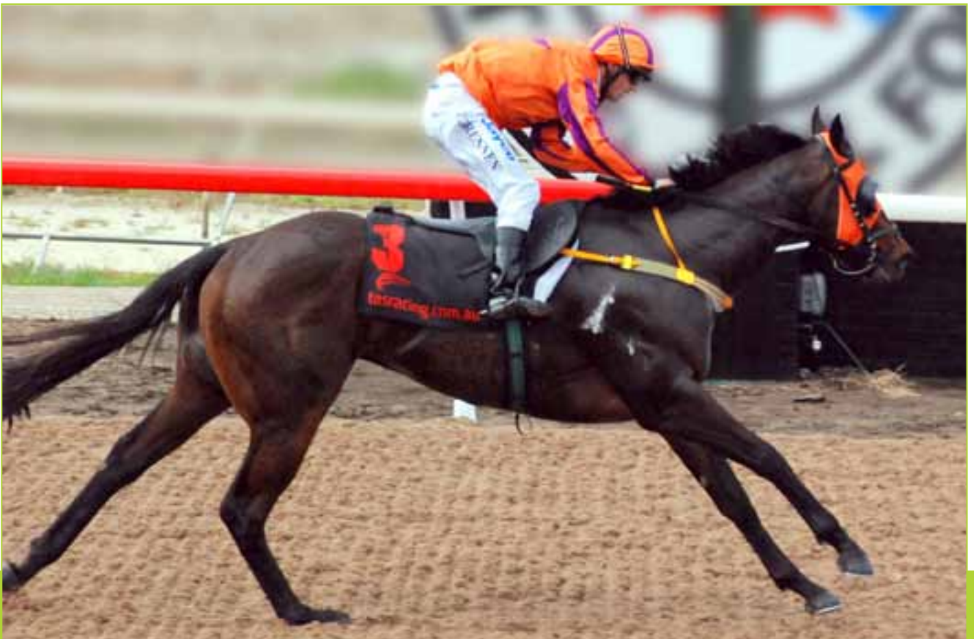
Tapeta Park, Devonport

All three tracks feature "breakaway" plastic running rails that greatly reduce the risk of injury for jockeys and horses