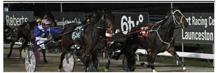
Izaha wins $40K Globe Derby Final - Story Page 14 | Story: Peter Staples | Photography: Stacey Lear