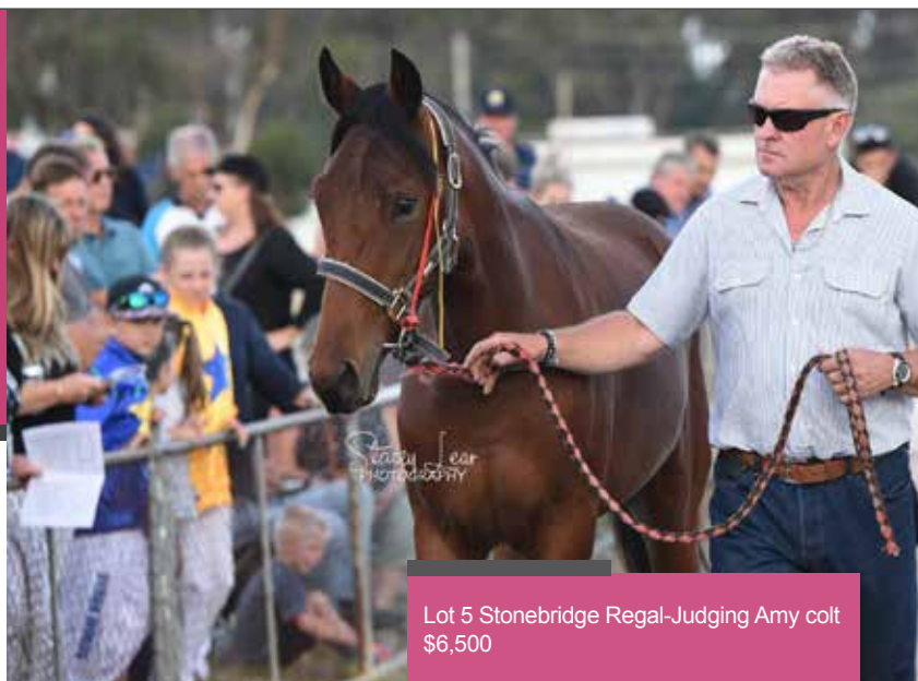
Lot 5 Stonebridge Regal-Judging Amy colt $6,500

The 2019 Tasmanian Harness Yearling Sale held at Carrick in February will go down on record as one of the most successful in recent years.