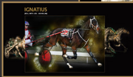
3YO Colt or Gelding of the Year