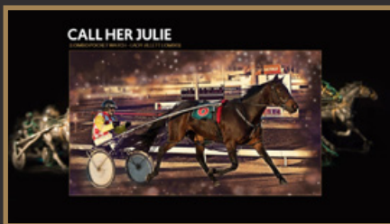
Mare of the Year