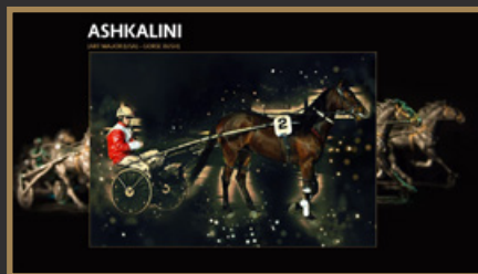
Broodmare of the Year