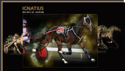
2018 Harness Horse of the Year