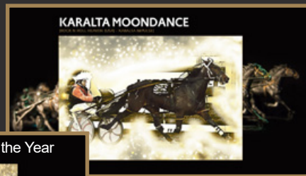
2YO Filly of the Year