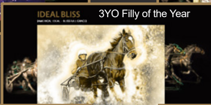
3YO Filly of the Year