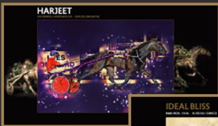
4YO or Older Horse or Gelding of the Year