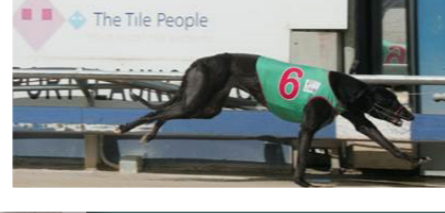
Daniel's Bay : Winner of 2014 Minister's Gift