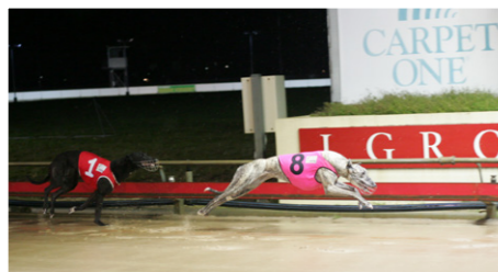
Left: Demi Cali - Tasmanian Oaks winner Pg 13 Left: Black Sienna - Devonport Breeders Classic winner Pg 13 Middle: Hey Franklin - Launceston Breeders Classic winner Pg 13 Right: Wynburn Witness - Hobart Breeders Classic winner

A best 8 race restricted to Grade 3 (sprint) greyhounds at Hobart to be conducted over 461 metres.