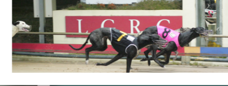
Left: Buckle Up Wes - National Sprint State final winner Top: Painted Dotty - National Distance State Final winner