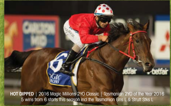
HOT DIPPED | 2016 Magic Millions 2YO Classic | Tasmanian 2YO of the Year 2016 5 wins from 6 starts this season incl the Tasmanian Ens L & Strutt Stks L